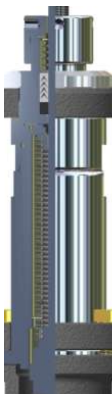
Bellows (-100°C / +350 °C)