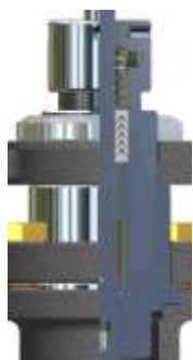
Standar (-30°C / +250 °C)